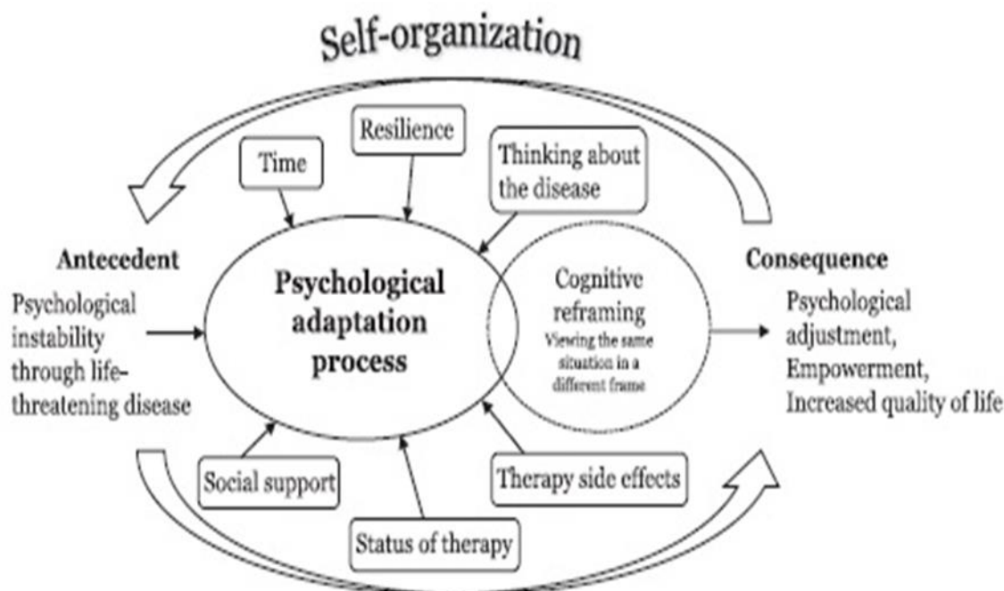
Figure 2. A theoretical model of self-organization.